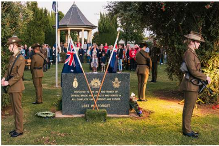
9th Combat Service Support Battalion - Catafalque Party