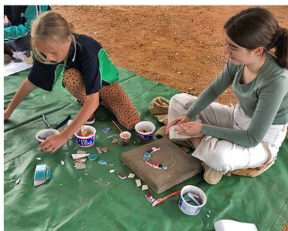
Making mosaic pavers for the Community Garden