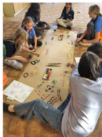
Writing stories using Aboriginal symbols after discussing Reconciliation Week